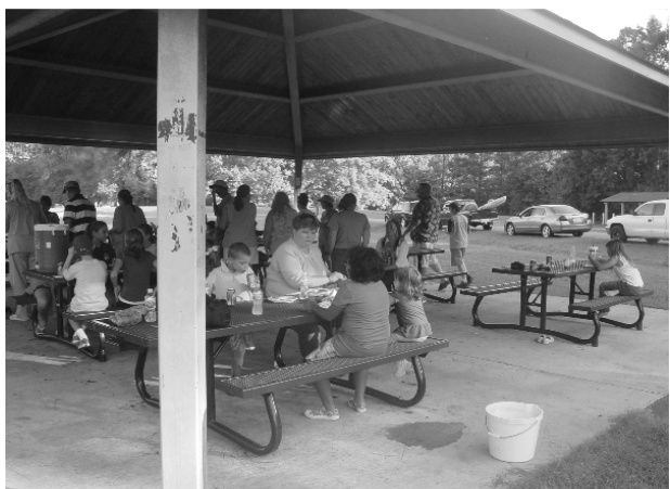
The group enjoys dinner under the picnic shelter