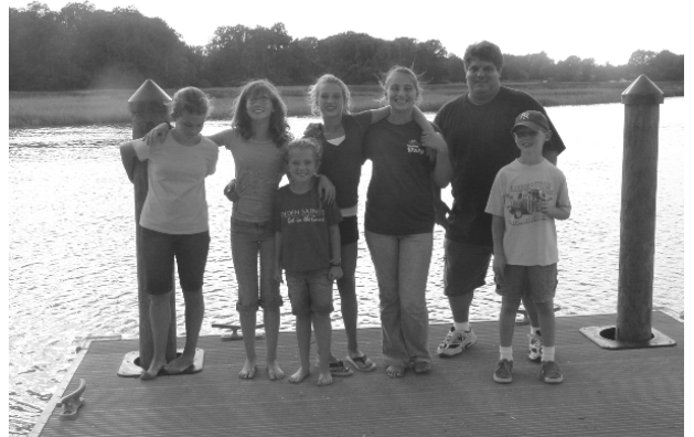
Stopping for a picture on the fishing pier

Shortly before dinner, several of the youth went nature walking, while others went to the river and walked on the fishing pier.