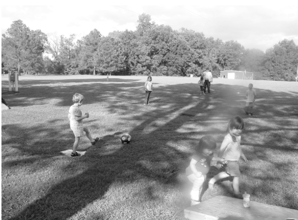
Ian kicks one out of the park, while the younger children play "corn hole"