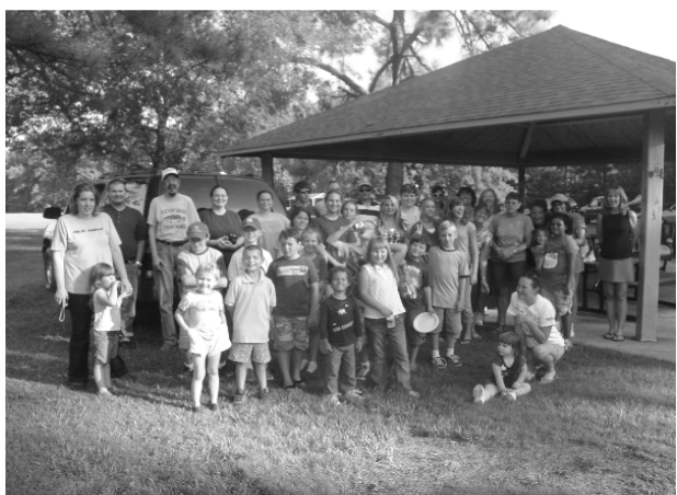
Everybody gathers for a group photo